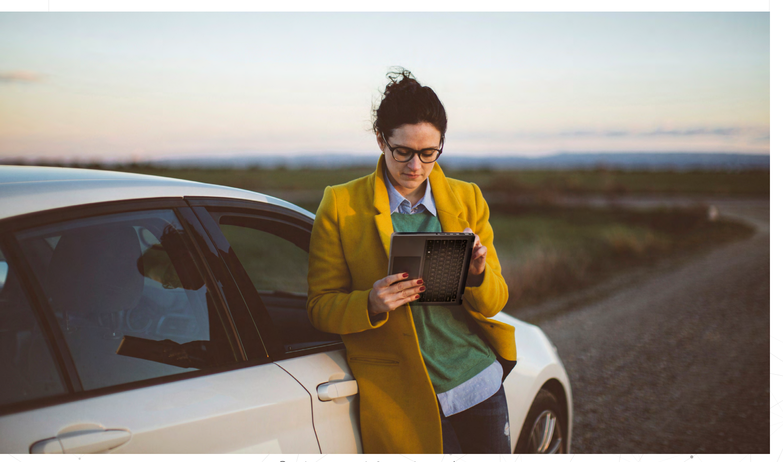
See important information on last page

Performance built for today's multi-tasking demands